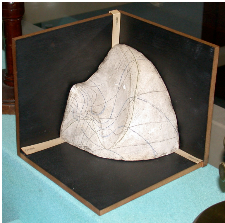
Figure 1. Plaster model of the equilibrium states of water constructed by James Clerk Maxwell and sent as a present to Josiah Willard Gibbs.

As illustration, consider an ideal gas. There are many functions of state for the gas: pressure p , temperature T , volume V , energy U , entropy S , mass M , density \rho , heat capacity C_v , ... The variables on this list are not independent in the sense that for a particular ideal gas, once we know two of them, the others are determined. In usual parlance, this means that the dimension of the manifold of equilibrium states is two 2 .